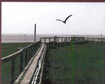
Seagull over catwalk.